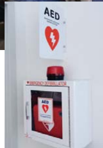
Three AEDs like this one are at the ready in various areas of ISI headquarters.